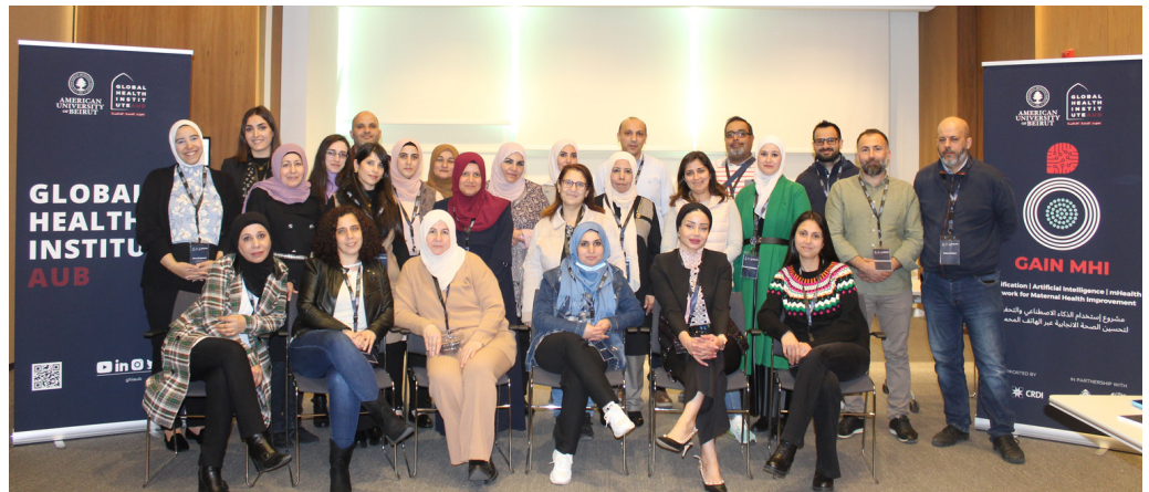
GAIN MHI Workshop 2023 | UNRWA Staff