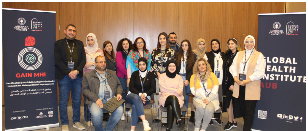
GAIN MHI Workshop 2023 | MOPH Staff

After a year of implementation of the multi-component digital health intervention of the Gamification, Artificial Intelligence and mHealth Network for Maternal Health Improvement (GAIN MHI) project at twenty primary healthcare centers (PHCs) across Lebanon, the E-Sahha Program has launched the post-intervention phase of the project.